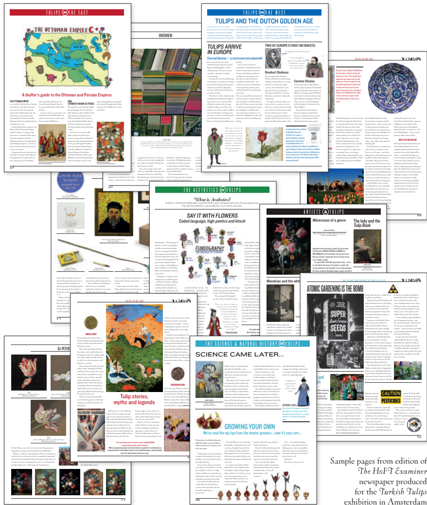
Sample pages from edition of The HoFi Examiner newspaper produced for the Turkish Tulips exhibition in Amsterdam