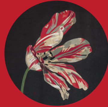
Sir Peter Blake, Tulip after Walscapelle, Flowers in a Glass Vase , 1995–96, acrylic on canvas, 21 × 21cm

These partnerships have included Tate, National Trust, RHS, Royal Shakespeare Company, Thames and Edinburgh Art Festival, Glastonbury and many more.